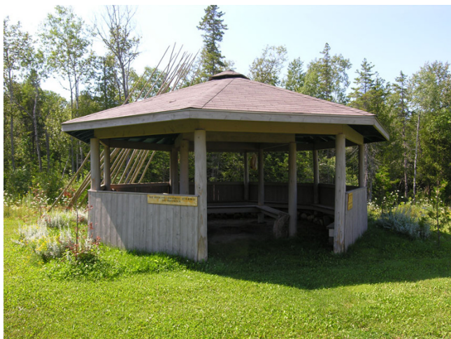
Figure 2 Arbor used for Traditional Aboriginal Healing Services.

rate with the primary care physician. The case manager updates physicians on treatments. Collaboration between other team members and physicians is limited, on an ad hoc basis, and often based on established personal relationships between providers. Ad hoc collaboration occurs usually when clients are admitted to emergency services. The collaboration with private practice therapists who provide short term counseling services under coverage by Health Canada's First Nations and Inuit Health Branch (FNIHB) crisis counseling program consist solely of referrals[14].