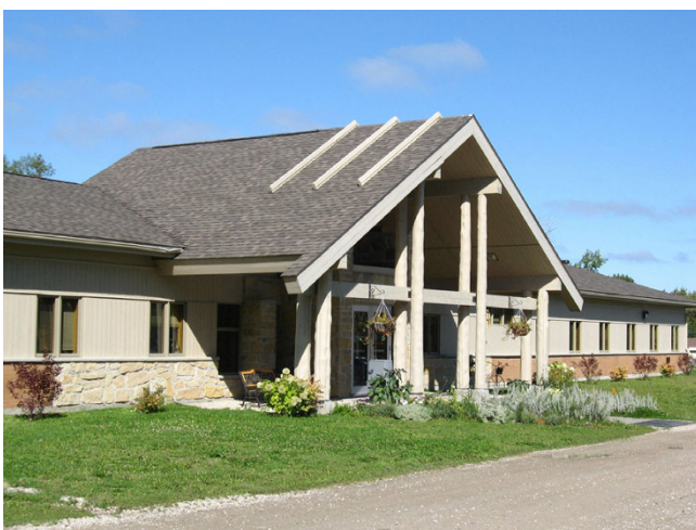
Figure 1 The Share Office Building.

The Knaw Chi Ge Win Team is a core of providers with expertise in psychology, mental health nursing, long-term care, social work and traditional Aboriginal medicine and healing. Clients can access services by referral or self-referral. In addition to the core services, visiting specialist consultant services are provided by psychiatrists and traditional Aboriginal healers, accessed by referral from the core team. Table 2 provides a list of the composition of staff and contract services. Mental health services are provided within an holistic Aboriginal framework that acknowledges the physical, mental, emotional, and spiritual aspects of health as well as historical, socioeconomic